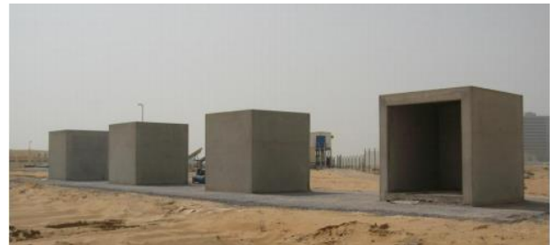
Figure 1. Solar Calorimeter installed at RAKRIC, UAE

insulation materials using the exact same conditions in terms of the size of the rooms as shown in Figure 1, the AC size used and using the same location. Radhi [10] focused on buildings in Bahrain with internal load dominated and does regression analysis on the existing building.