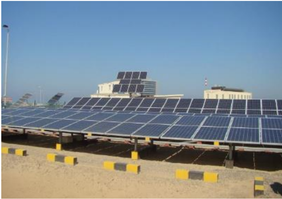
Figure 3. Installation of 59 kWp PV System at RAKRIC, UAE